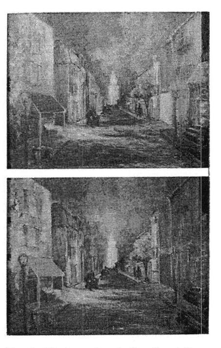
Fig. 1. Photographs of the Street Scene taken with the 656-nm (top) and 546-nm (bottom) filters in uniform illumination.

Experiments have shown that color sensations can be generated by the in-